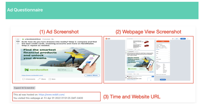
Figure 2. Screenshot of an ESM prompt for a sampled online ad and its associated webpage view.

3.1.1. Experience Sampling Method (ESM). We used the ESM to capture users' perceptions towards specific ads they encountered in their day-to-day web browsing, as well as their desire for explanations thereof. We implemented a Firefox browser extension to record online ads that participants encountered during the four-week study period<sup>1</sup>. The extension logs advertisement information (e.g., screenshot, website title, URL) to generate ESM prompts.